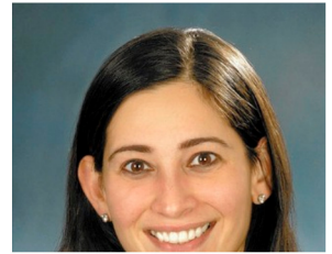
Mucous cysts are more annoying than dangerous