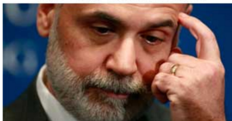
U.S. Govt. nuclear debt bomb – nearing meltdown. The 90-day fuse has just been lit.