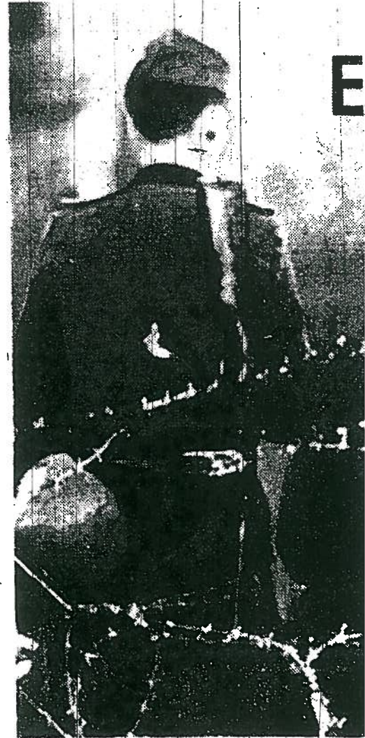
BERLIN—Barbed wire and soldiers of the East German army guard the border between East and West Berlin to prevent refugees from fleeing.

The East German government closed the gate, the chief crossing point between East and West Berlin, and